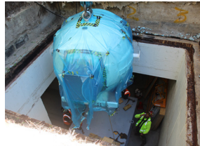
An access hatch was opened to allow the machine to be lowered into the sub-basement, then maneuvered to its destination in the Stitch Radiation Oncology Center.