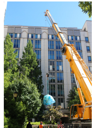
A towering rig lifted the 20-ton Gamma Knife off a flatbed and maneuvered it into position.

The Gamma Knife Icon will be the latest addition to what is already one of the most robust stereotactic radiosurgery (SRS) programs in the Northeast. NewYork-Presbyterian provides spine-specific radiosurgery with the ViewRay® system at its world-class David H. Koch Center on York Avenue as well as radiosurgery for larger brain lesions with the Novalis® configuration in the Stitch Radiation Oncology Center on 70th Street. There are also Gamma Knife and Ethos installations at the Columbia campus.