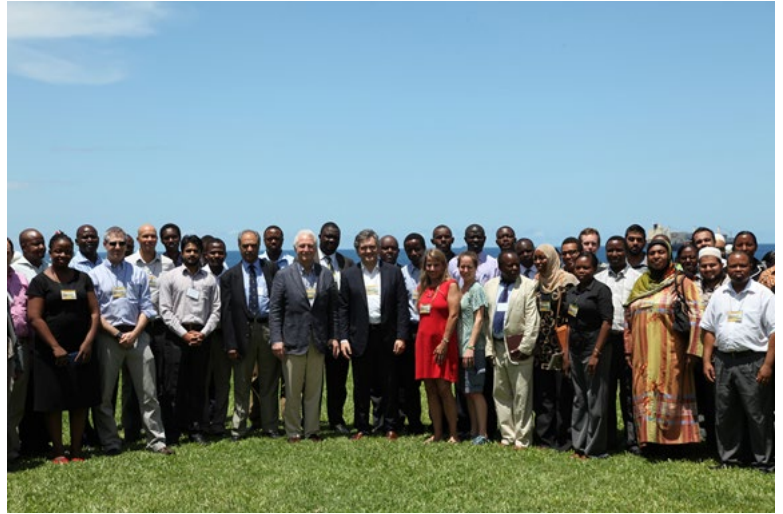
Some of the participants in the first hands-on neurotrauma course, March 3, 2014. Dar Es Salaam, Tanzania.